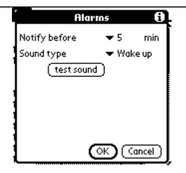
Figure 8. ATV – Alarms settings

• Different fonts support for Sony Clie (4 fonts)