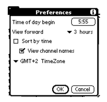
Figure 7. ATV – preferences

New features that were added in version 2.0: