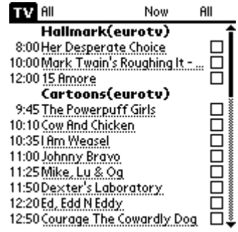
Figure 1. ATV main screen

Working area of the Zaval Advanced TV Guide is as follows (see Figure 1):