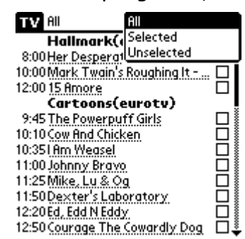
Figure 3. ATV – show All programs/Selected only/Unselected only

Suppose, you have already selected programs that you don't want to miss and want to make a brief overview of this selection. It can be done by another selector – see Figure 3 . Now you can see only selected programs, only unselected or both.