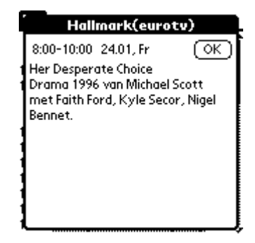
Figure 6. ATV – view program details

Some programs go with a brief annotation ( Figure 6 ). To see it make a click on the desired program.